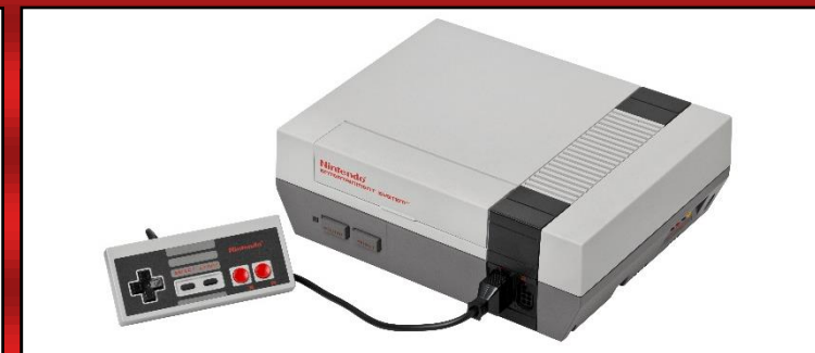
Controller plugged into Control Deck