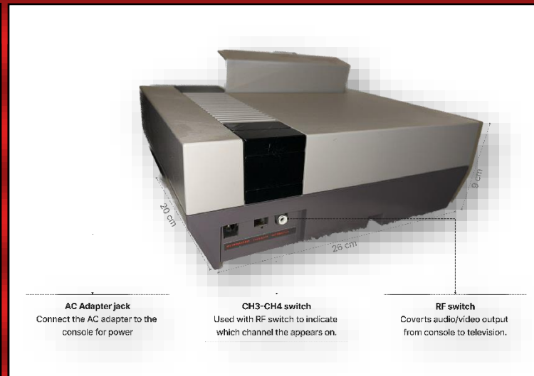
Control Deck back view